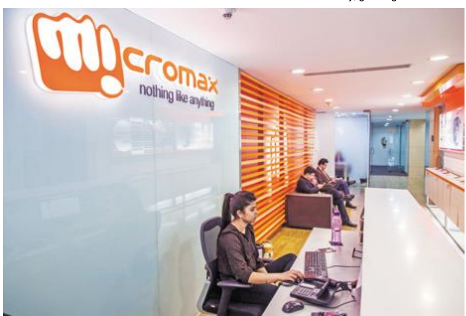
Micromax says will get its volume leadership back